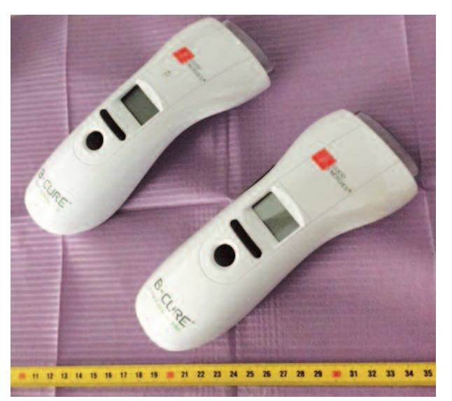
Figure 2: Devices used blindly by the patients: treatment device and placebo device.

In a recent study, Kobayashi et al <sup>25)</sup> hypothesized that one of the pain relief mechanisms when