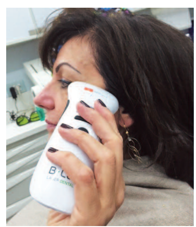
Figure 1: Laser application on the TMD.

In this study it was used the B-Cure Laser (Israel). It is a Class I safety little device (173 g of weight) emitting in the IR spectrum (808 nm). A green aiming beam is provided to show the irradiation area corresponding to 4.5 \text{ cm}^2 .